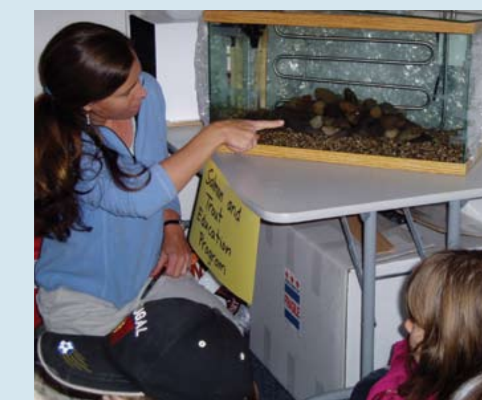
THE STEP PROGRAM INCLUDES HATCHING STEELHEAD EGGS IN THE CLASSROOM