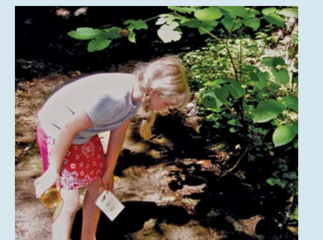
A STUDENT LOOKS FOR JUVENILE STEELHEAD IN FALL CREEK