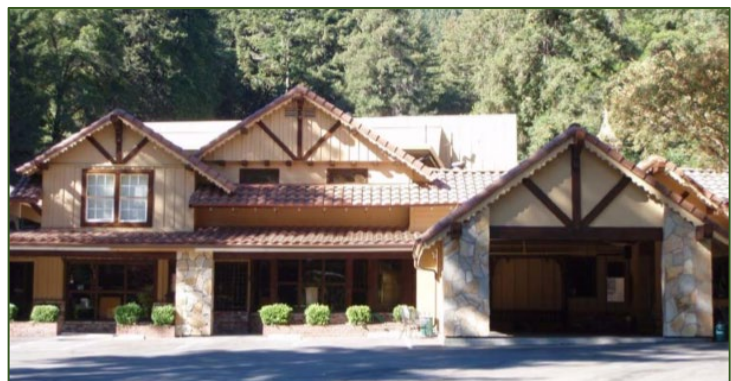
Brookdale Lodge, Brookdale