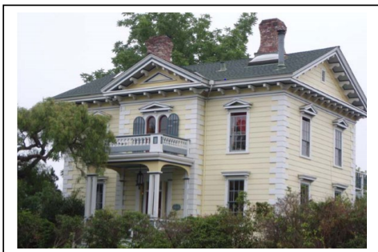
Daubenbiss House, Soquel

California Office of Historic Preservation 1725 23rd Street, Suite 100 Sacramento, CA 95816 (916) 445-7000 https://ohp.parks.ca.gov/